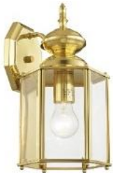
Indiana Lighting - $100.50 item#11TK9 (13" H x 7" W)