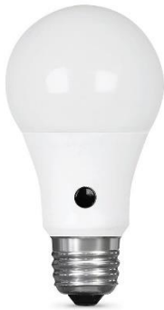
Home Depot - $6.97 60W Equivalent Soft White (2700K) A19 IntelliBulb Dusk to Dawn CEC Title 20 Compliant 90+ CRI LED Light Bulb