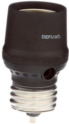
Home Depot - $9.98 CFL/LED Screw-In Dusk to Dawn Light Control, Black